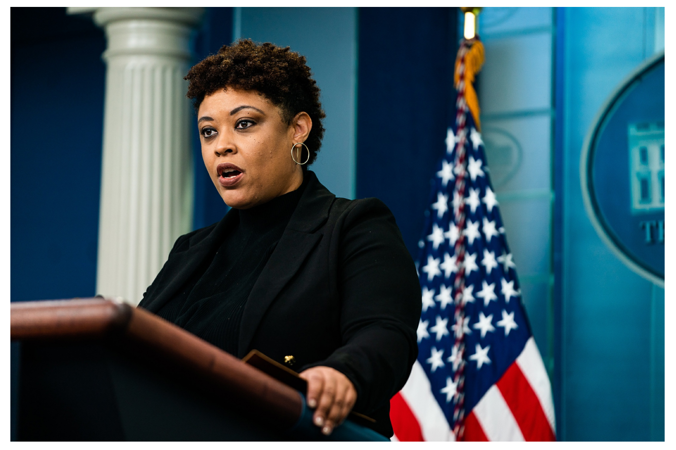
Shalanda Young during a press briefing at the White House on May 4, 2023: hotographer: Demetrius Freeman/The Washington Post/Getty Images

Negotiators met for weeks to hammer out details of a budget deal, after the speaker vowed to block a "clean" bill that would simply raise the US debt ceiling without spending cuts.