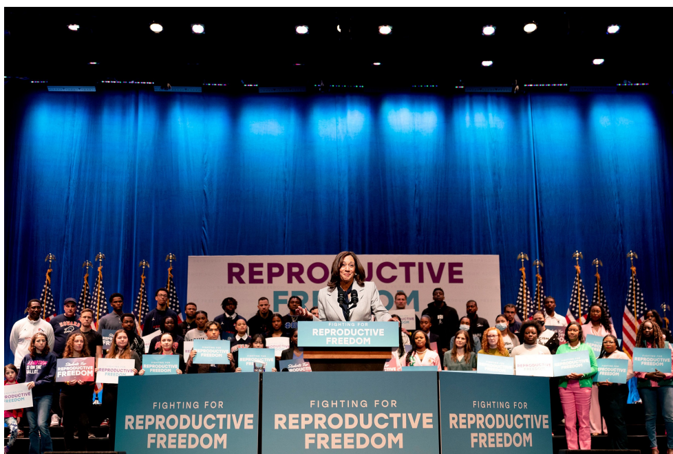
Harris speaks on reproductive freedom at Howard University in Washington, DC, on April 25.

Harris has been more visible both at home and abroad. During the Africa trip, she unveiled corporate-backed efforts to mitigate gender inequality. Visiting Asia, Harris toured the demilitarized zone in September after North Korean missile tests and in November spoke briefly with Chinese President Xi Jinping on the sidelines of a summit.