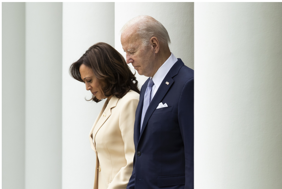
Biden and Harris arrive at an event in the Rose Garden of the White House in Washington, DC, on May 1.

Harris’s allies say her early stumbles were unfairly magnified by her historic position.